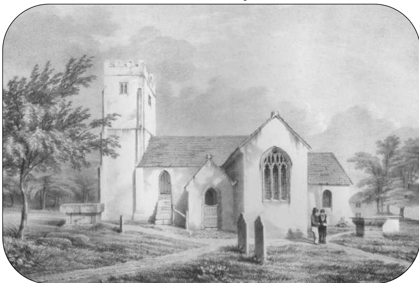
St. Catherine's Church, Whitestone 1841